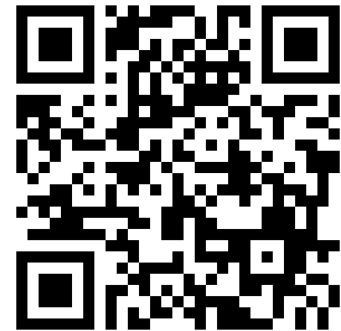
Windsong PTO Volunteer Opportunities